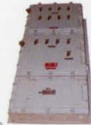
DB/31340 Ex-d IIA/IIB Lighting Distribution Board