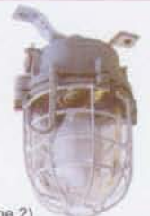
40031 Ex-e (Zone 2) Wellglass / Pendant Light Fixture suitable for upto 200W GLS / 125W HPMV /160W MIL LAMP