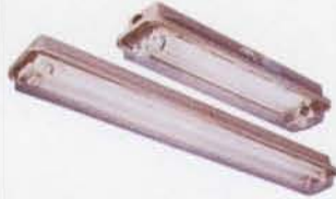
NLLK - 96 Series Ex - N / Ex - e (Zone2) Fluorescent Tube Light in Non-Metallic Enclosure