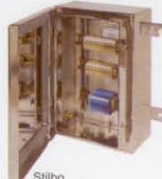
Stilbo Ex-e Stainless Steel Enclosures IP 65