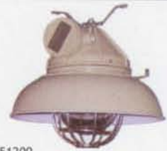
LW-51200 Ex-IIA/IIB&IIC Wellglass / Pendant Light Fixture suitable of upto 200W / 125W HPMV / 160W MLL LAMP / 70W MH/150W MH