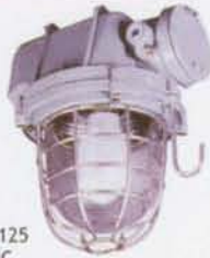
LW-51125 Ex-d IIC Wellglass / Pendant Light Fixture integral suitable for upto 125W HPMV LAMP / 70W MH / 2x26W CFL