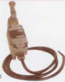
LC-61200 Ex-s IIC Limit Switch