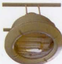
FLP 2 x 23w/26w Bulk Head Fixture (Bottom Open able)