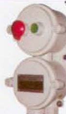
PB-31202 /PB-61202 Ex-d IIA/IIB & IIC START-STOP Control Station