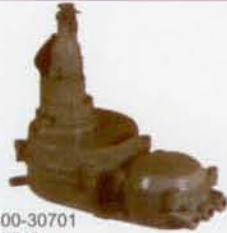
LC 31400-30701 Ex-d HA/MB Switch Socket combined with built in transformer 16A, 24V, Spin tating