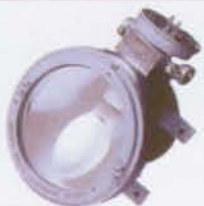
LB-61201 /LB31201 Ex-d IIA/IIB& IIC Bulkhead Light Fixture suitable for upto 200W GLS /160W MIL/ 125W HPMV LAMP/ 150W MH/2x26W CFL