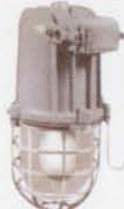
LW-21202 Ex-e (Zone 2) Wellglass / Pendant Light Fixture integral suitable for upto 125W HPMV LAMP