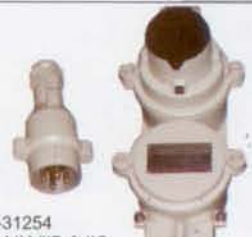
PB-31254 Ex-d IIA/IIB & IIC Switch Socket combined with plug top Rated upto 25A , 500V AC.