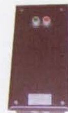
FLP Start Stop Push Button Station