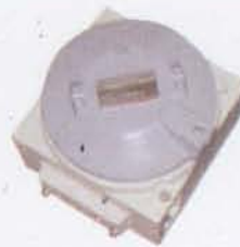
Ex-d IIC Multiway -junction Box