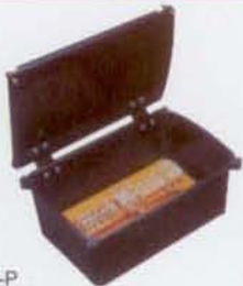
Smart-P Polyester enclosures IP 65