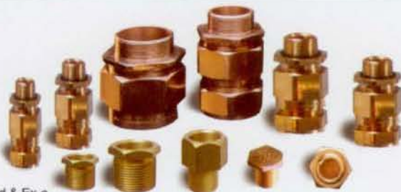
Ex-d & Ex-e Cable Glands and Conduit Accessories