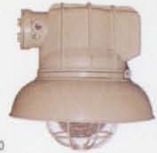
LW-31250 Ex-d MB Wellglass/ Pendant Light Fixture Integral suitable for upto 250 W HPMV LAMP