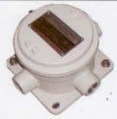
IJ-61100/IJ-31100 Ex-d IIA/IIB & IIC Lighting -junction Box