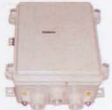
LC-21401 Ex-e (Zone 2) Control Gear Box Suitable for upto 400W HPMV LAMP