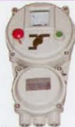
LC51000 Ex-d IIA/IIB & IIC Control Station