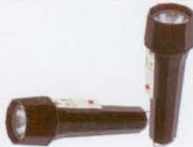
Stabex H3EN (3 cell) Stabex HEN (2 cell) Safety Torch 2 or 3 cells