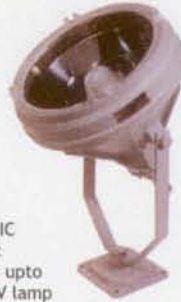
LF-61400/ LF-31400 Ex-d MB & IIC Flood Light suitable for upto 400 W HPMV lamp