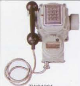
TW91201 FLP & Intrinsically Safe Telephone