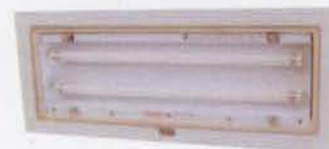
2x36w Tube Light Fixture (Zone-2) (Bottom Open able)