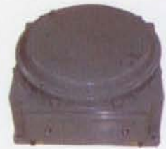
30401 Ex-d IIC Junction Box