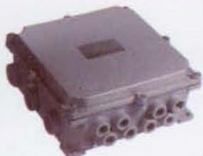
JB/1004-4 Ex-e Multi-Way Junction Box