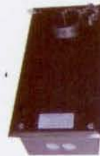
FLP Switch Socket Combined with Plug top.